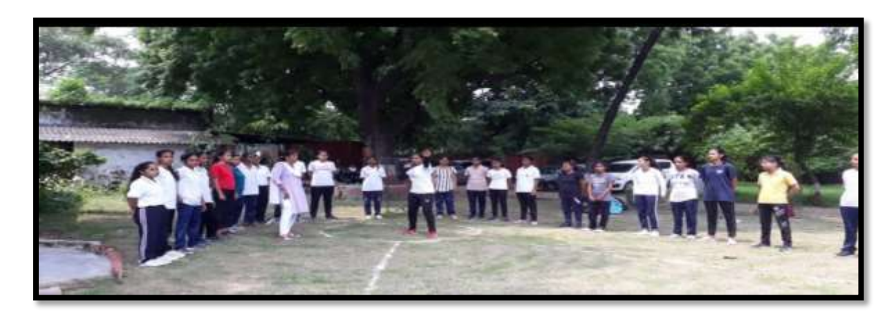
Practicing Shot Put