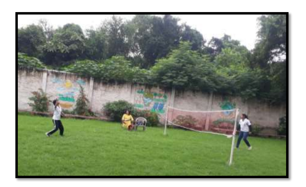
B adminton Court