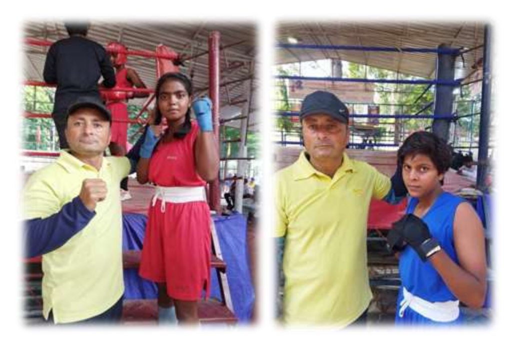
Boxing Champions of the college