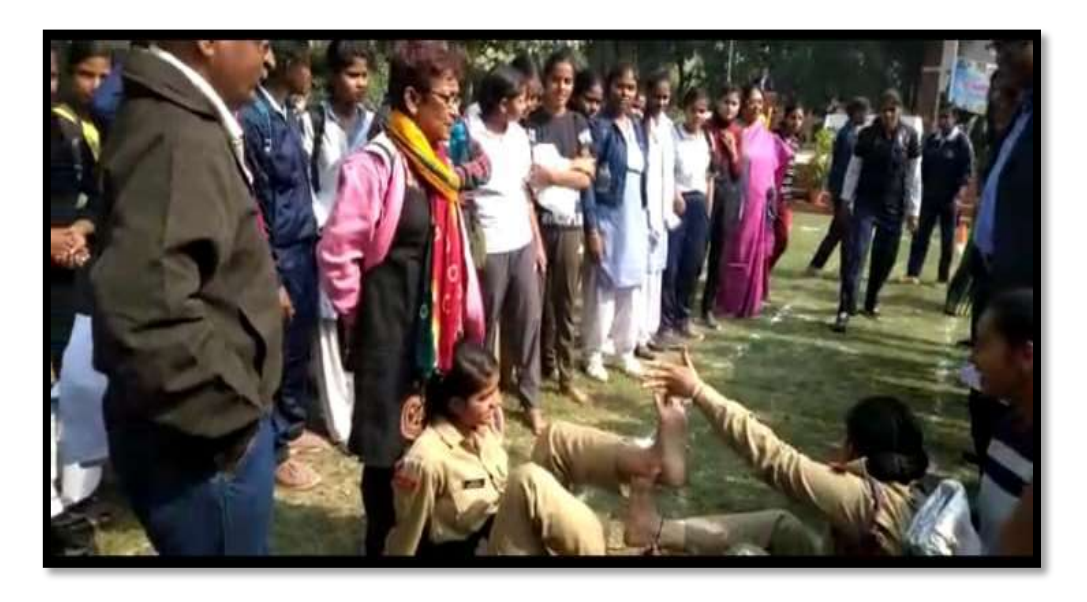
On 2<sup>nd</sup>Dec.22, the first Bhule Bisre Khel was organized in the college in association with UPNOA.