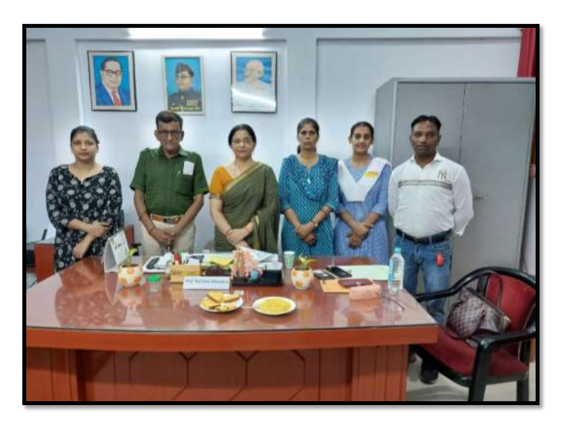
Sports Club Committee Members

To promote yoga, physical fitness, intramurals and inter collegiate competitions the college created the Victory Sports Club